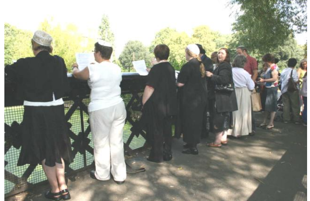
Feeding the ducks at the Tashlich ceremony (above)