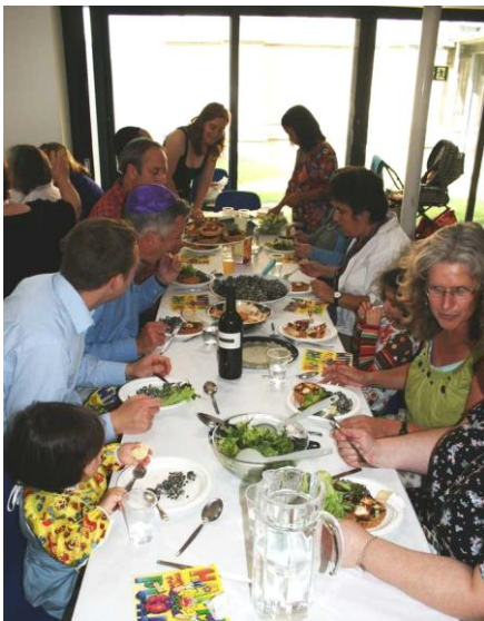
Rosh Hashanah lunch (left) and decorating the Sukkah (right and below left).